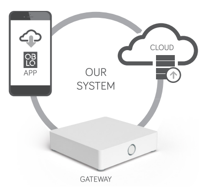
Illustration 6: Our System

OBLO Living client application is intuitive and easy to use. Its comfortable graphical user interface will smoothly guide users through the process of configuration of their space. The app can be used both in-home or remotely – it is smart enough to connect to the gateway directly if possible, to ensure the best user experience.